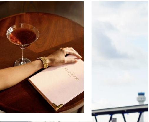
^ Evoking South Florida's golden age, The Flamingo Grill invites guests to dine in a timeless, social setting that is at once intimate and energetic.